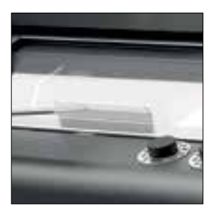
Safety cover Locked during the cutting cycle, prevents any access to the blade. Removable for ease of cleaning.