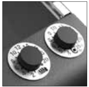
Control panel Enables the user to choose the thickness and number of slices. - From 3 to 25 mm*