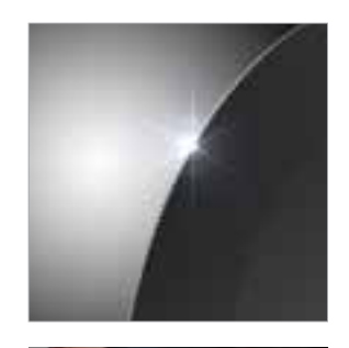
Teflon-coated stainless-steel blade Non-stick for the clean cutting of all types of bread.