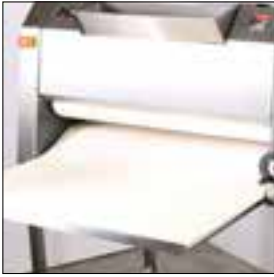
Outfeed table on slides