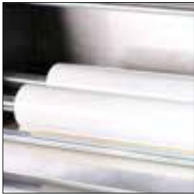
Two food-grade polyethylene rollers