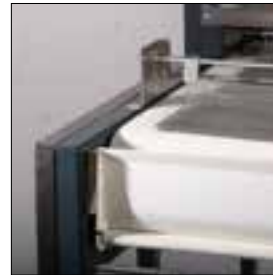
Return table Self-adjusting according to the size of the dough pieces.