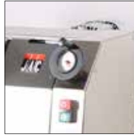
Ergonomic, accurate indicators