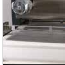
Progressive elongation Thanks to the chain mail